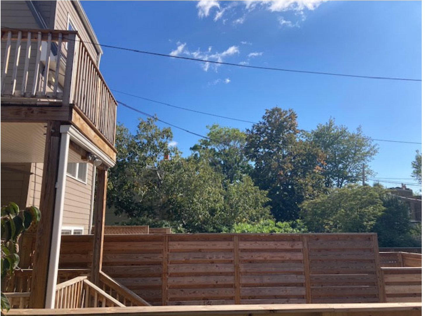
Figure 8. Looking east from 1225 E St, 23.5 feet from my rear wall