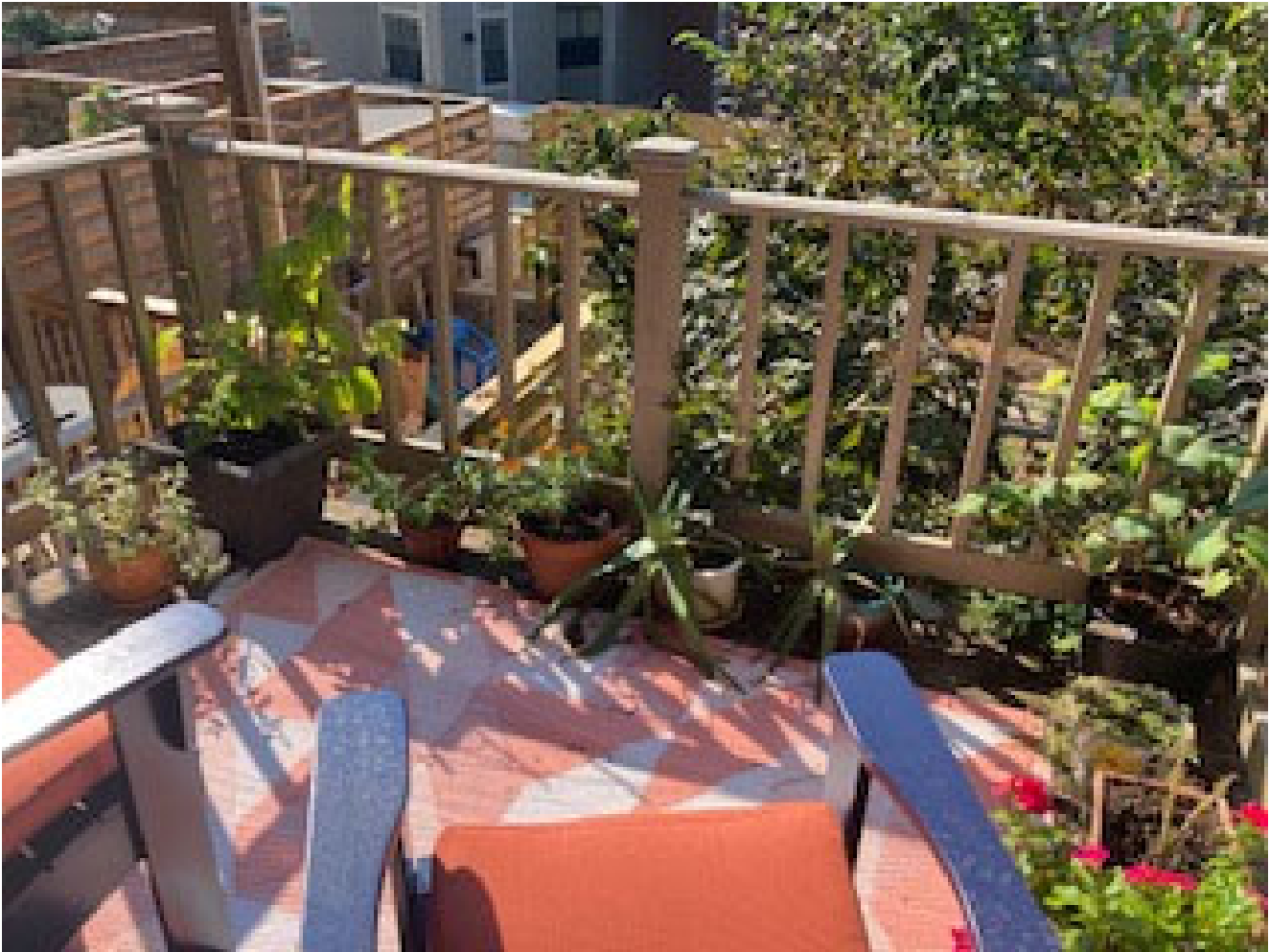
Fig 3. Sunporch with plants